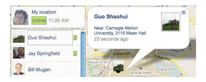
Figure 1: A screenshot of Locaccino.

be useful for learning security and privacy policies, the user must always be in control of the underlying policy. This means that the policy suggestions made by the algorithm must be intelligible by the user, and the user must be able to approve or refute any changes the algorithm makes. Additionally, as the user's preferences evolve, she may want to manually change the underlying policy. The algorithm should therefore be able to adapt to this, incorporating new manual policy changes into the underlying model. This suggests an incremental approach to policy learning.